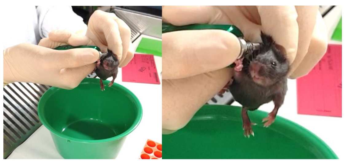
Figure 1. Placement of the notching device above a clean container (UQBR 2020)

6. Swiftly engage the mechanism to perform ear notch