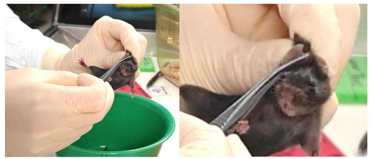
Figure 2. Using forceps to remove tissue resting on the fur (UQBR 2020)

Note: the tissue sample may fall onto the work surface and be drawn into the Cabinet filter. To prevent losing the tissue sample, complete the work over a tray with raised edges ensuring airflow of the cabinet is not obstructed, or work well inside the work area.