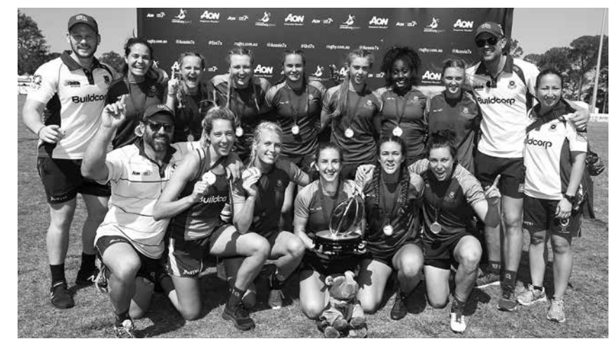
UQ won the inaugural Aon Uni 7s Series, taking victory in all four tournaments and every match of the competition.

A 10-year Development Plan was completed for the Gatton campus. This plan sets out a strategy to realise the University's ambition for the Gatton campus to become Australia's premier plant, animal, veterinary science teaching and research campus and a worldclass location for subtropical and tropical agricultural, plant and animal sciences.