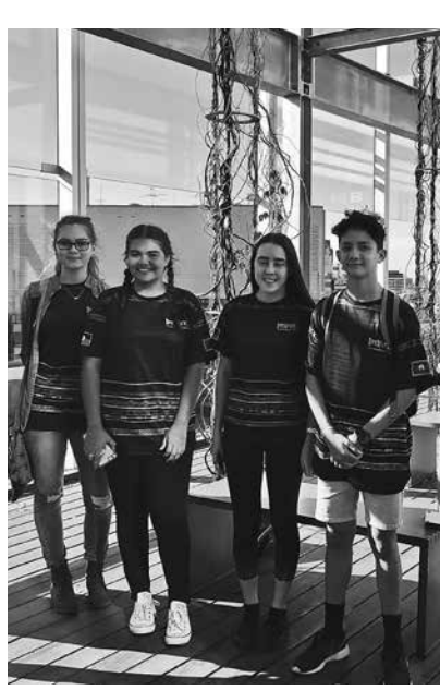
InspireU Law camp participants on the Supreme Court Library and Legal Heritage Centre tour.

Students enquiring about available volunteer