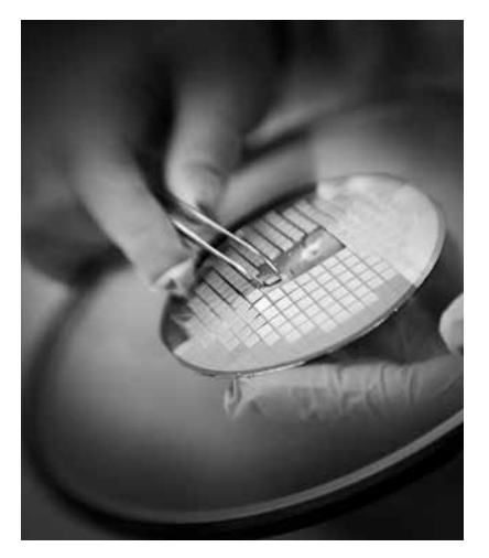
Needle-free Nanopatch technology developed at UQ was used to successfully deliver an inactivated poliovirus vaccine in 2016.

the 17 Australian recipients: four other UQ students also received $10,000 Westpac Asian Exchange Scholarships to support their interest in Asia and help develop their global leadership skills.