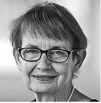
Communication and Arts was one of five UQ academics to win a Citation for Outstanding Contributions to Student Learning in the Australian Awards for University Teaching.

<sup>2</sup> UQ transferred the UQ Ipswich campus to the University of Southern Queensland (USQ) on 7 January 2015: see page 56 for more information