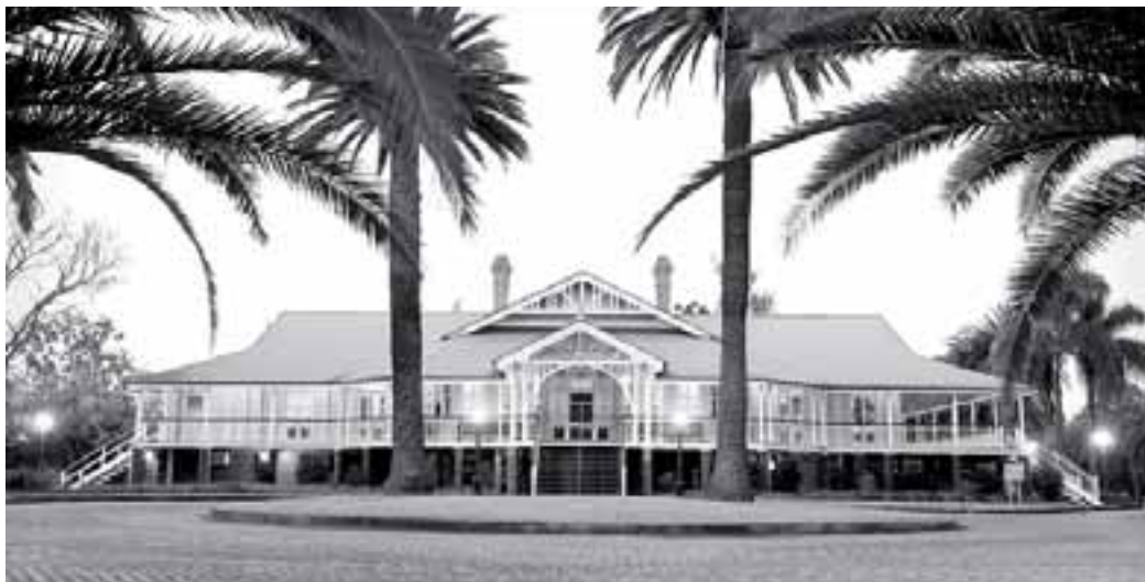
◀ The Foundation Building, UQ Gatton... more than a century old and the first building on a 1068-hectare campus now offering some of the nation’s best programs in agribusiness, agriculture, animal studies, environmental management, horticulture and veterinary science

Under sections 7-10 of the Act, the University Senate (pages 12-14, 18) is the governing body responsible for management and control of University affairs. The Act also defines financial responsibilities and specifies matters on which Statutes can be made.