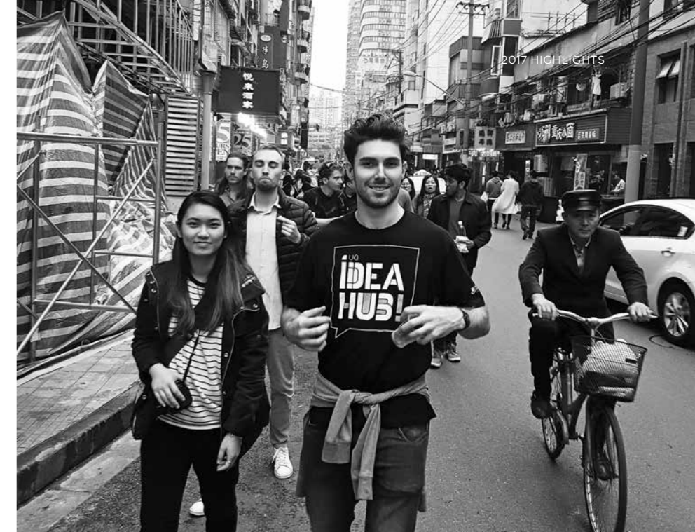
Students on the recent China Mobility Program in Shanghai for the UQ Idea Hub.