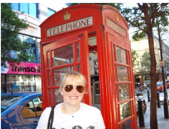
My iconic London photo – had to do it!

I could literally go on for days about the amazing time I've had in Leeds! I think it is the perfect Uni to go to as it is amazing for student life, and so close to everything else! Don't be scared to try it! I know the application process seems like the most annoying/difficult thing to do. But persevere! As soon as you land you will realise it was alllllll worth it! Save as much money as you