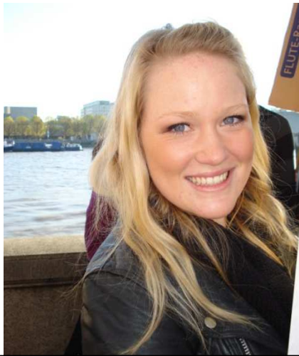
In London, on the river Thames – demonstrating against the rise in student fees.

DOOOOO IT!!!!!! Honestly, that is all I can say. Exchange has been the GREATEST, most exciting and fulfilling experience of my life! I have dreamed of going on exchange since I was around 14 and I can truly say that it exceeded all of my wildest expectations (and my expectations were sky-high)!