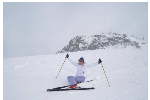
Nearly dying on the slopes in Val d'Isere! Good times, good times.