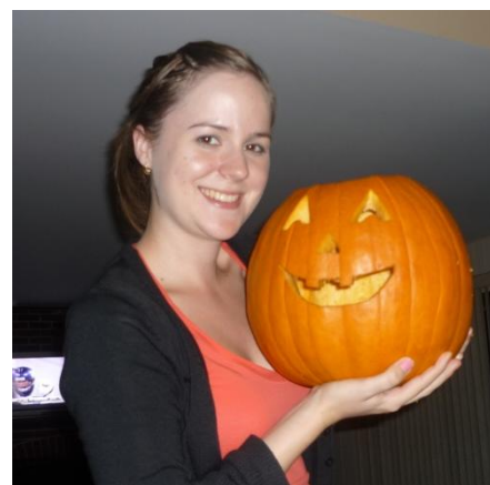
My very first carved pumpkin for Halloween