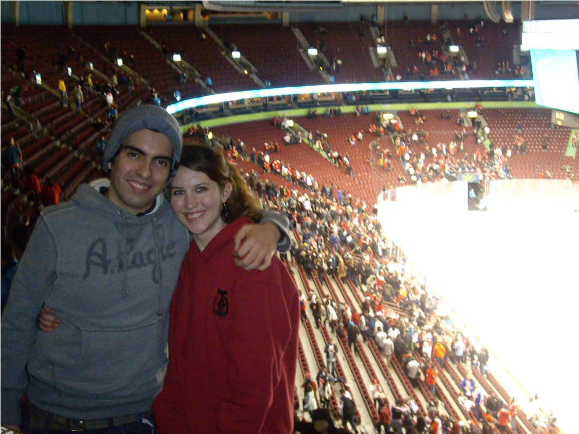
Olympics ice hockey match!