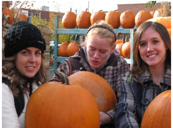
Pumpkin carving for halloween

Montreal is an amazing city for an exchange – the McGill campus is downtown and students live everywhere – in the ‘Ghetto’ (the main student neighbourhood, just east of campus), on every downtown street and in the beautiful neighborhoods around town. The French was a little intimidating after the mono-lingualness of Australia - if you want to try to integrate into the city of Montreal, watch for a bit of culture shock! The McGill campus is a little anglo island in the middle of a French city and as a consequence the student life is very active and the community pretty tight knit.