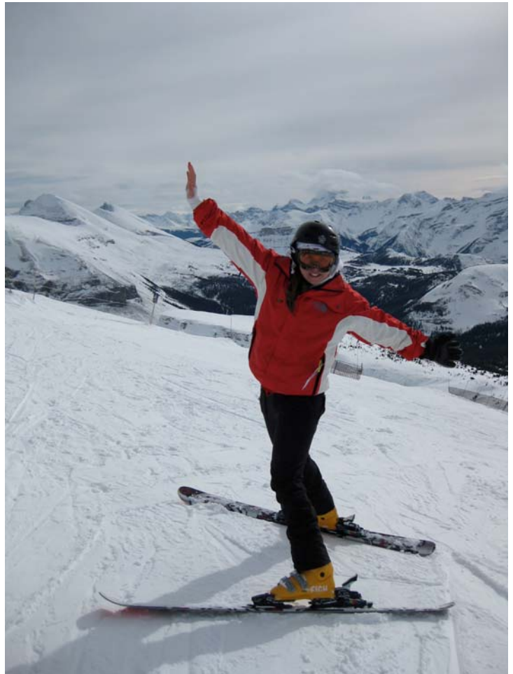
Skiing in Banff

I extended my trip four times – I love Montreal and I got a job at a research lab for summer so I decided to stay on as long as I could. Staying for almost 12 months meant I made some really great friends who took me to visit their homes with them. It also allowed me to see a lot of North America – during the year I went to the east coast of Canada (Nova Scotia and Prince Edward Island) in fall and summer, visiting my other friends on exchange in Chicago, skiing in Banff in winter, travelling to Boston, New York and Washington with my sister in spring, visiting a snowy Quebec City, cross country skiing in the Laurentians, a couple of sunny weekends in Ottawa and Toronto and finally a roadtrip from Calgary to Vancouver and back in summer.