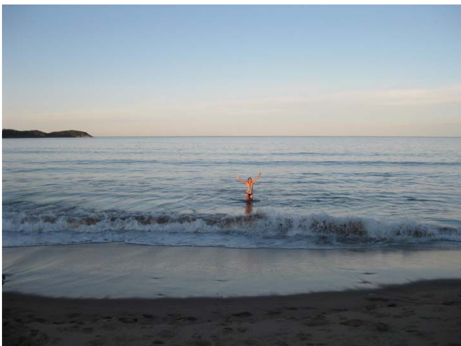
Swimming in the Atlantic in Nova Scotia