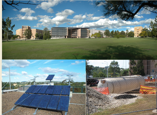
General Purpose North 4 building, opened in 2008, incorporates a range of environmentally sustainable features.

UQ incorporates a range of sustainable features into buildings and grounds to continually improve its environmental performance.