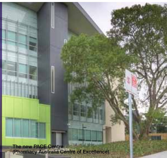
The new PACE Centre (Pharmacy Australia Centre of Excellence).

LOCATION: PACE, 20 Cornwall Street, Woolloongabba