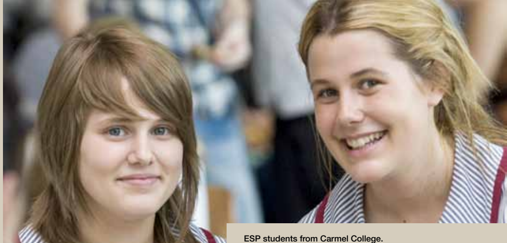
ESP students from Carmel College.

In 2011, courses on offer include animal studies, mathematics, history, philosophy, economics, accounting, psychology, law, languages, music and political science.