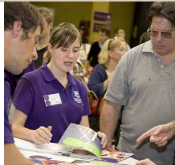
Staff and students interacting with visitors to TSXPO.

KEY DATES: Saturday 17 and Sunday 18 July, 2010.