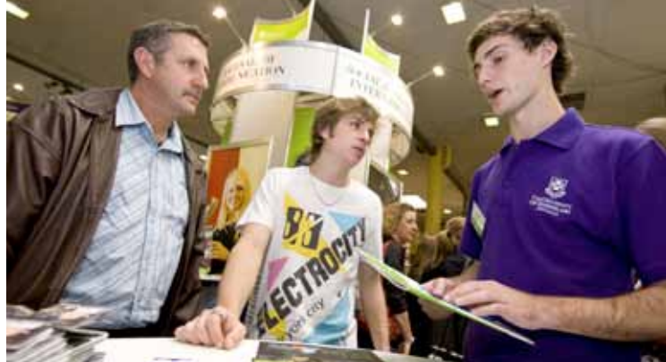
UQ student ambassadors assisting visitors at TSXPO.

KEY DATES: Monday 20 September until Friday 1 October, 2010.