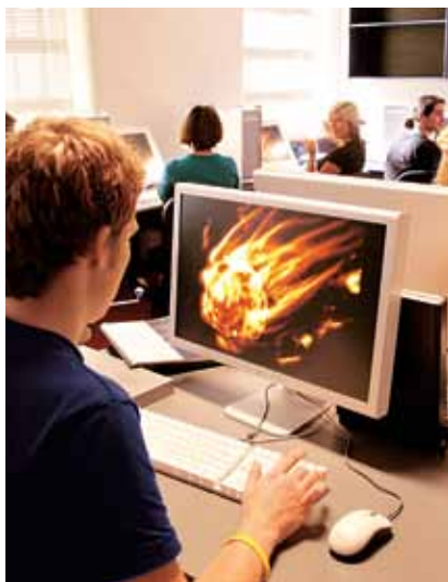
Multimedia computer laboratory at UQ Ipswich

More information about UQ's assessment processes will be available during O Week (see page 16).