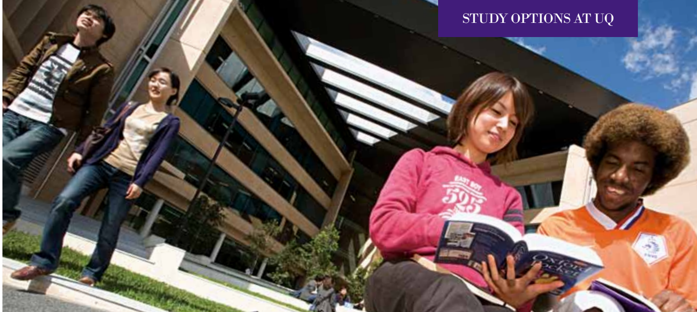
Students outside the new state-of-the-art Sir Llew Edwards Building – UQ St Lucia