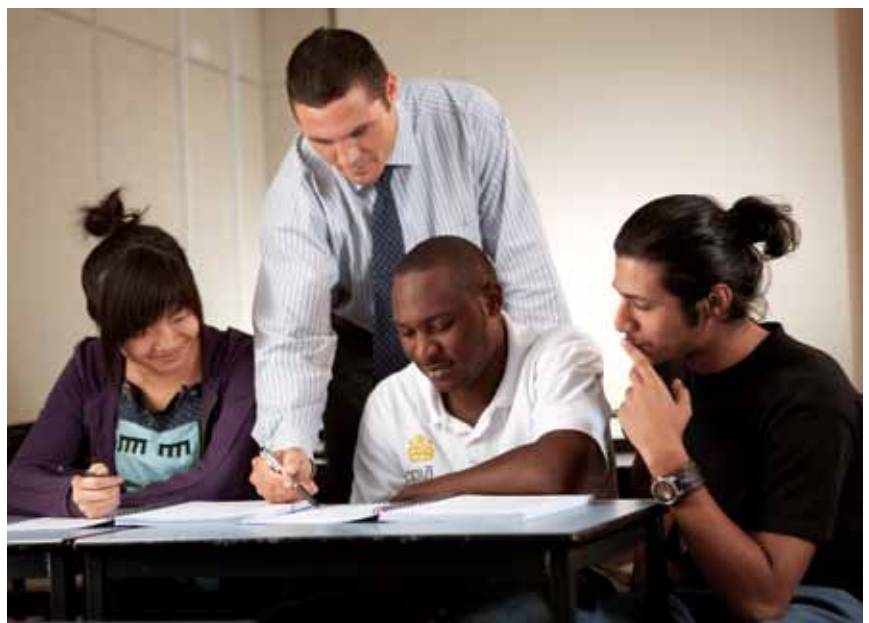
Small class sizes are a feature of foundation year

International Education Services (foundation year) www.foundationyear.com Email info@fdn.uq.edu.au Phone +61 7 3832 7699 IES CRICOS Provider Number 01697J ICTE CRICOS Provider Number 00091C