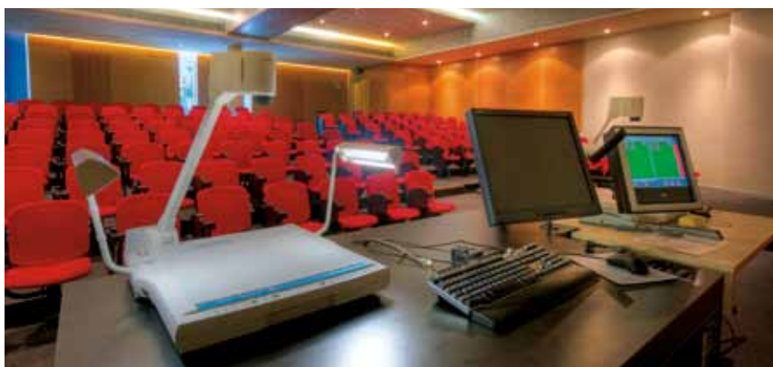
Lecture theatre, UQ St Lucia