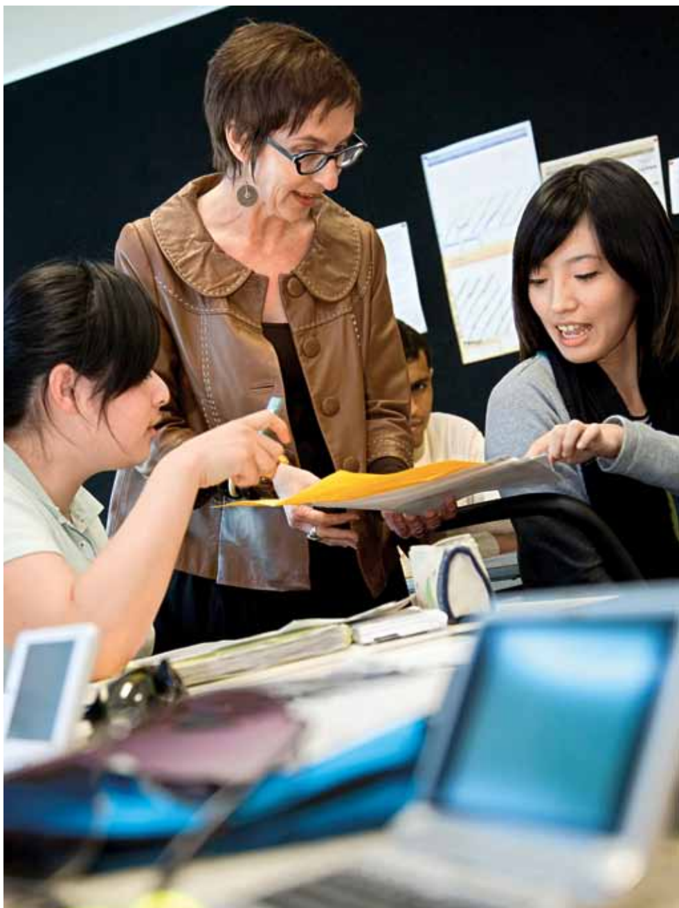
English language students at UQ

Institute of Modern Languages www.iml.uq.edu.au Email iml@uq.edu.au Phone +61 7 3346 8200