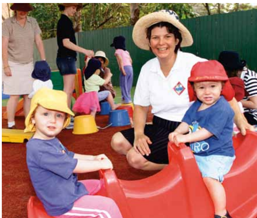
Munro Childcare Centre staff and children

This table is not a comprehensive list of all childcare centres available.