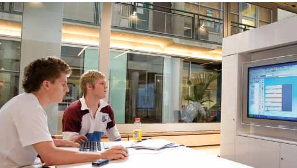
Engineering Learning Centre, UQ St Lucia