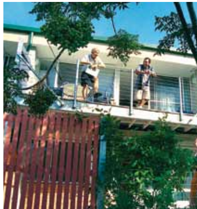
The Gatton Halls of Residence