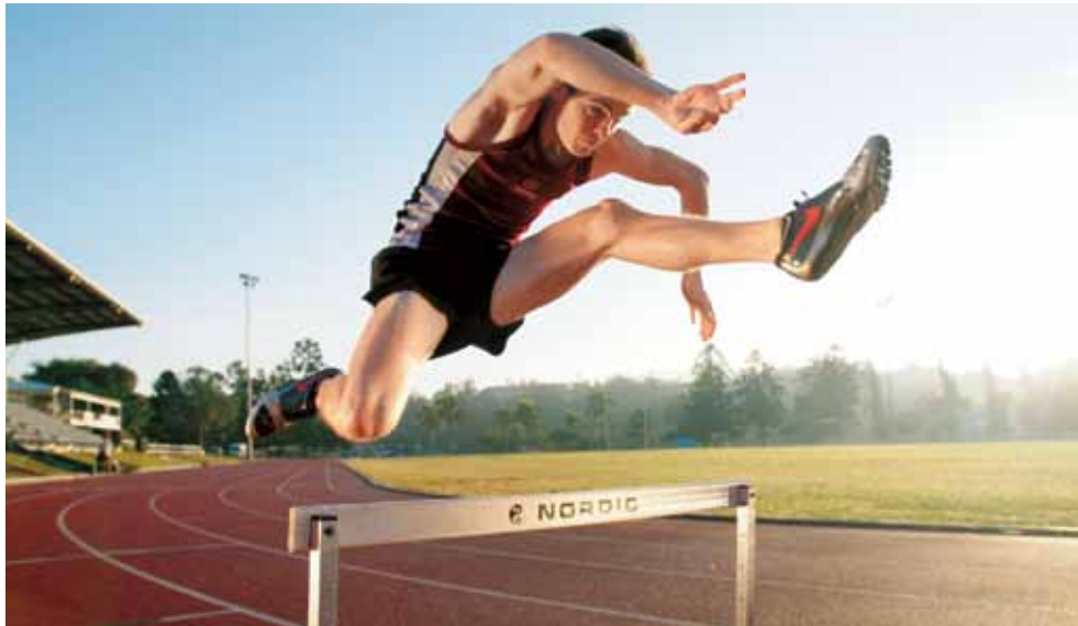
UQ St Lucia athletics track

Things to do www.uq.edu.au/about/things-to-do