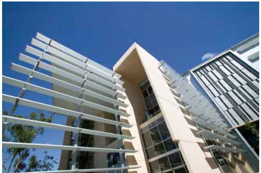
Sustainable Minerals Institute, UQ St Lucia

Sustainable Minerals Institute (SMI) www.smi.uq.edu.au