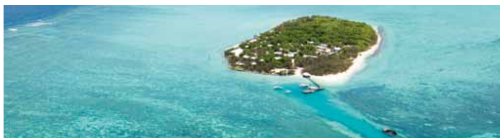
Heron Island on the Great Barrier Reef, where the UQ Heron Island Research Station is situated