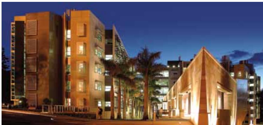
Institute for Molecular Bioscience at the Queensland Bioscience Precinct, UQ St Lucia