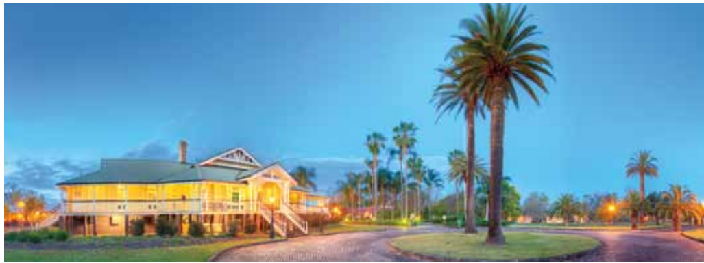
The heritage-listed Foundation Building at UQ Gatton