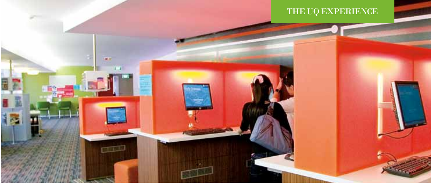
Student Centre, UQ St Lucia

check email and personal student records, study resources, and calendars.