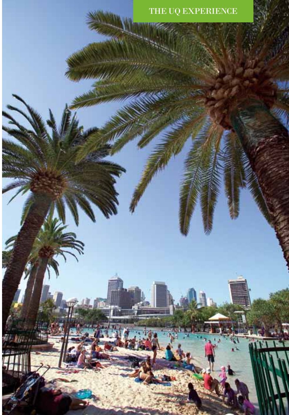
South Bank Parklands, Brisbane