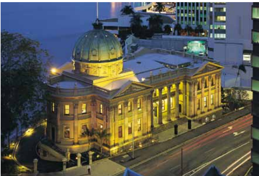
Customs House, UQ's cultural, educational and heritage facility in Brisbane's city centre