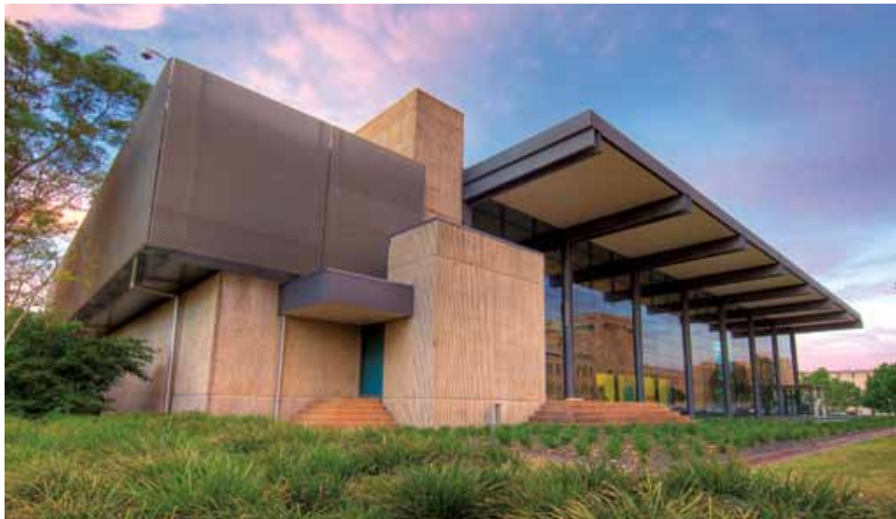
The University of Queensland Art Museum