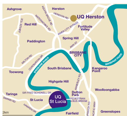
UQ's expansive St Lucia campus

UQ St Lucia www.uq.edu.au/about/st-lucia