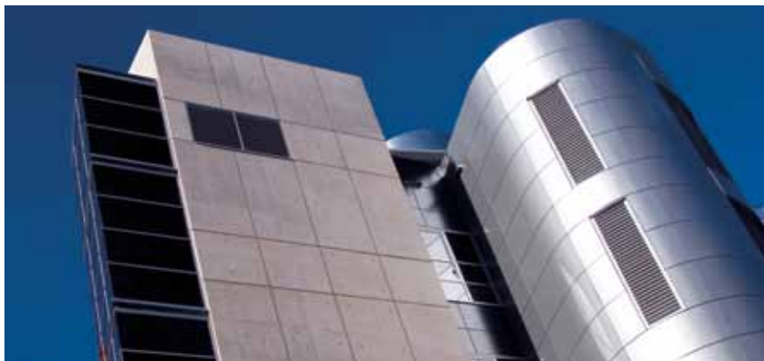
Australian Institute for Bioengineering and Nanotechnology (AIBN)