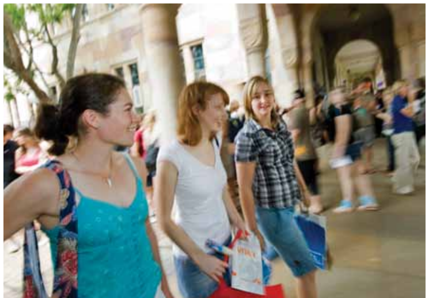
“O Week” activities

UQ Union www.uqunion.com.au Phone +61 7 3377 2200