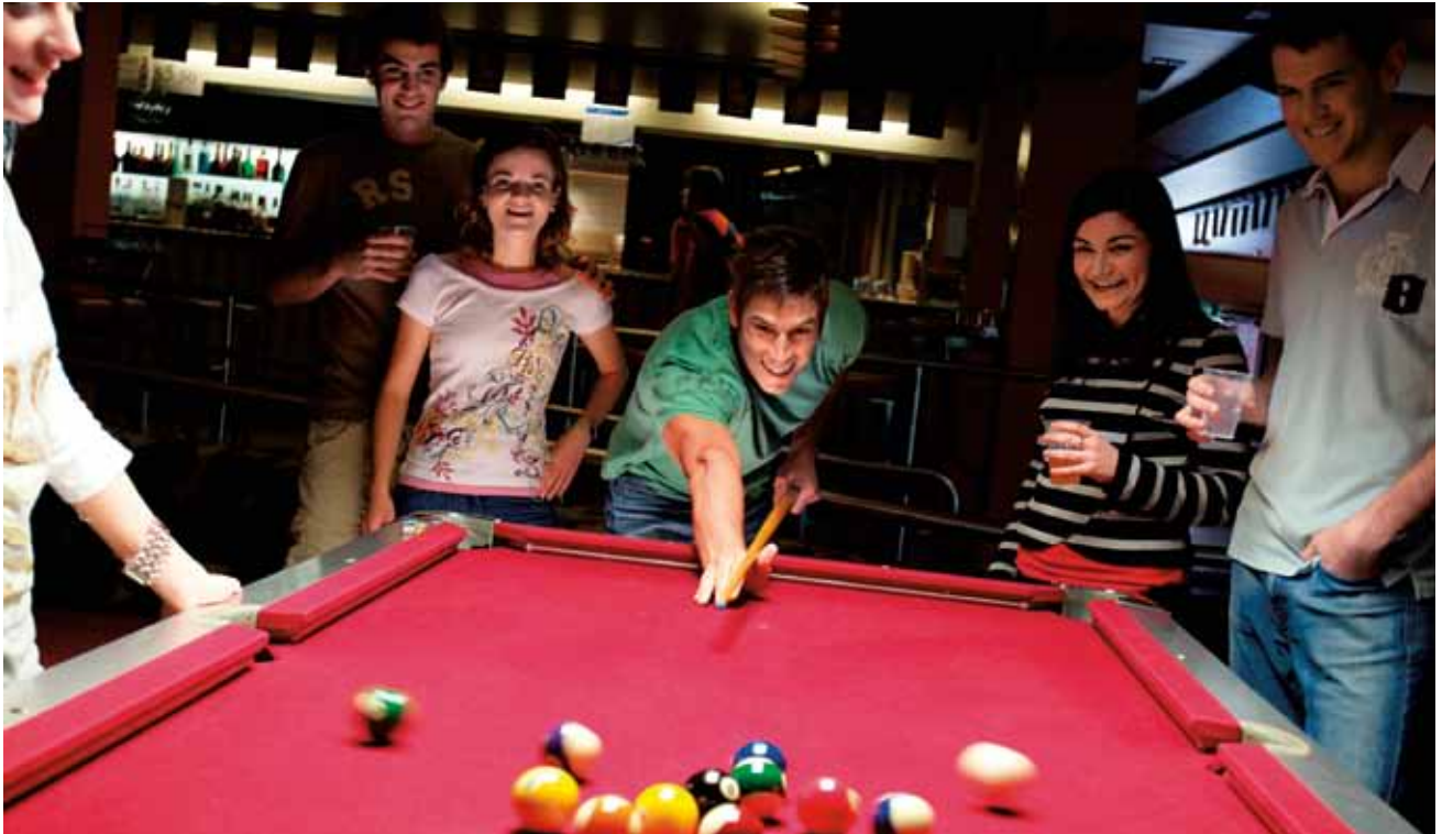
Students taking a break at the newly refurbished 2nd Degree Bar and Grill, St Lucia