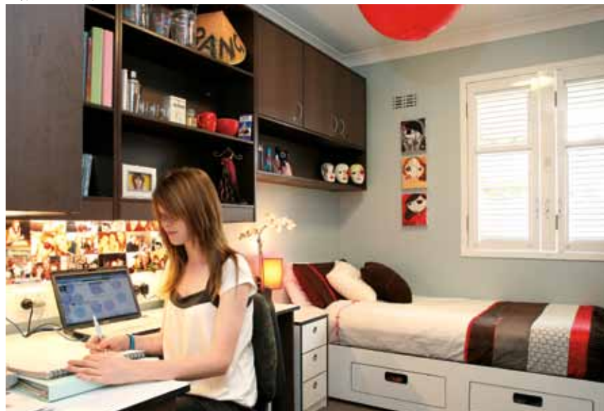
A typical on-campus student room