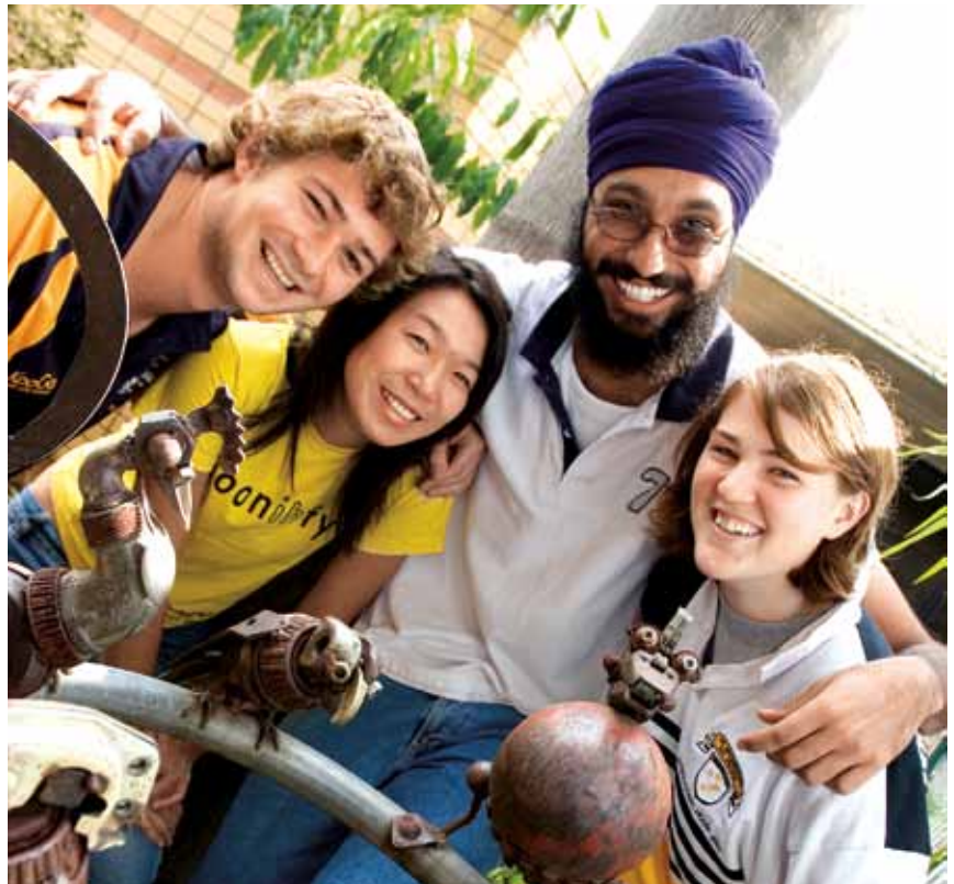
Residential college students

Students may choose to stay in one of the self-contained on-campus houses managed by UQ Accommodation Services. Students may choose to rent a room in a fully furnished share house that accommodates up to four people.