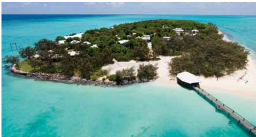
Heron Island on the Great Barrier Reef, where the UQ Heron Island Research Station is situated

Australian Institute for Biotechnology and Nanotechnology (AIBN) www.aibn.uq.edu.au