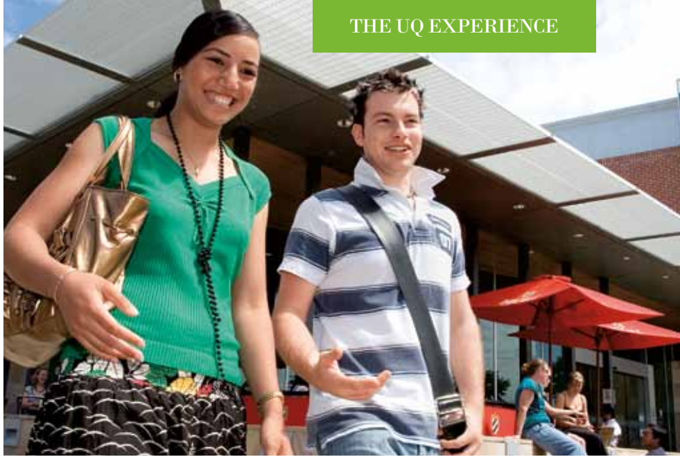
Students outside the award-winning UQ Ipswich Library