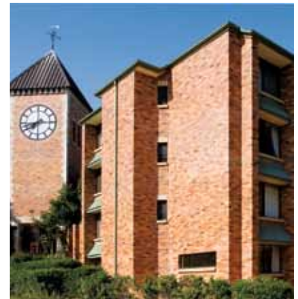
St John's College

Each student is allocated their own room and shares a bathroom, kitchen and lounge room facilities. Alternatively, students can rent an entire house for themselves and their families. Houses can be rented furnished or unfurnished subject to availability.