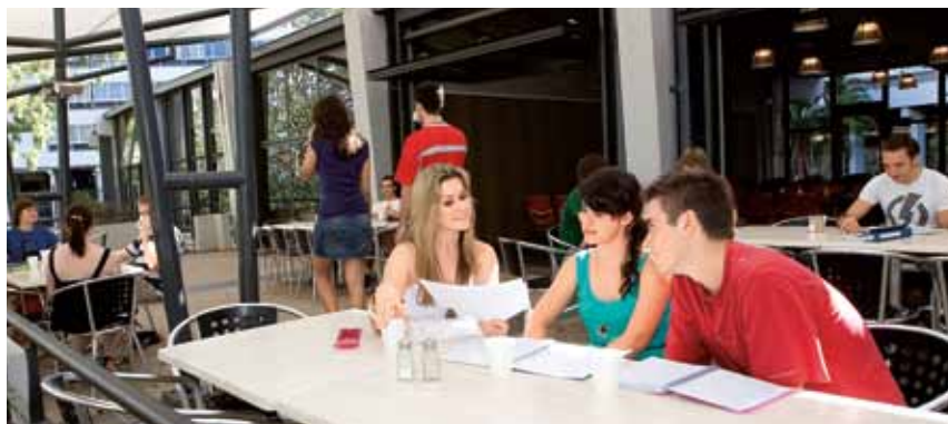
All colleges have their own dining facilities