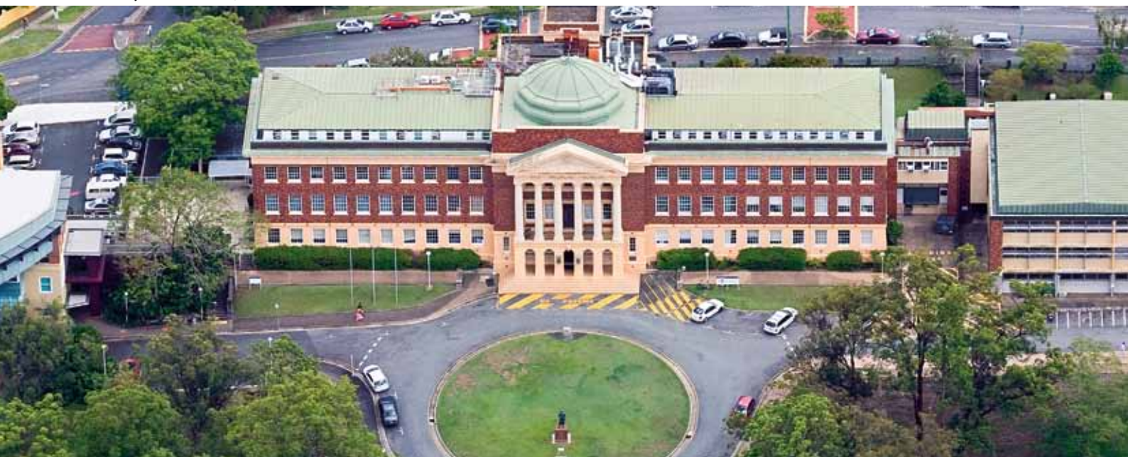
Mayne Medical School, UQ Herston