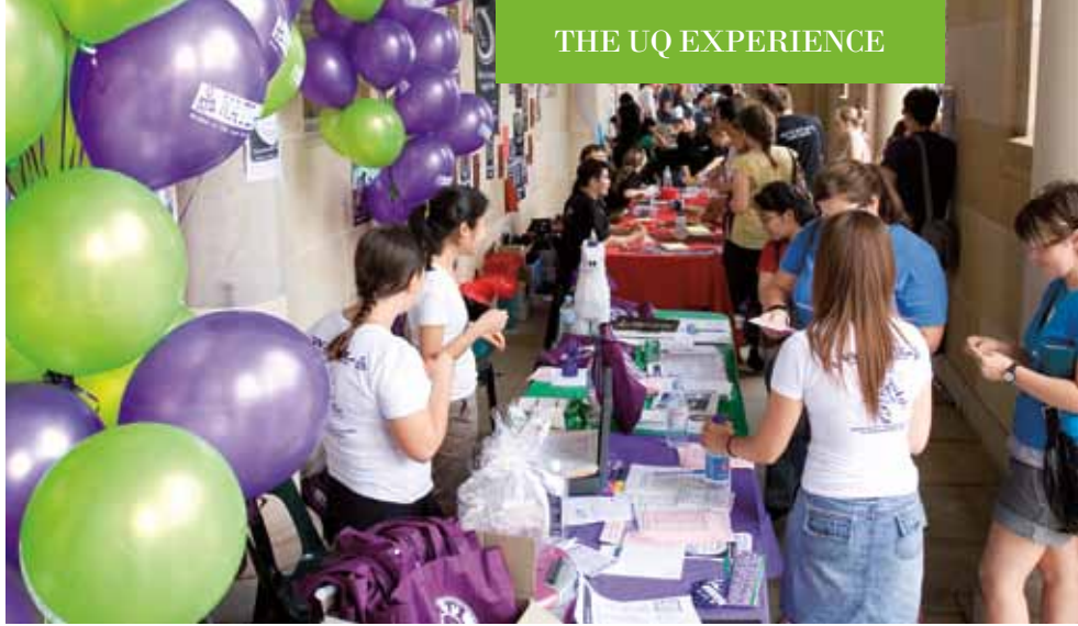
Students joining clubs and societies at "O Week"