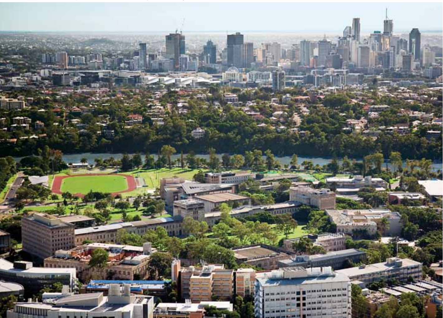
UQ St Lucia campus, with Brisbane River and city centre in background