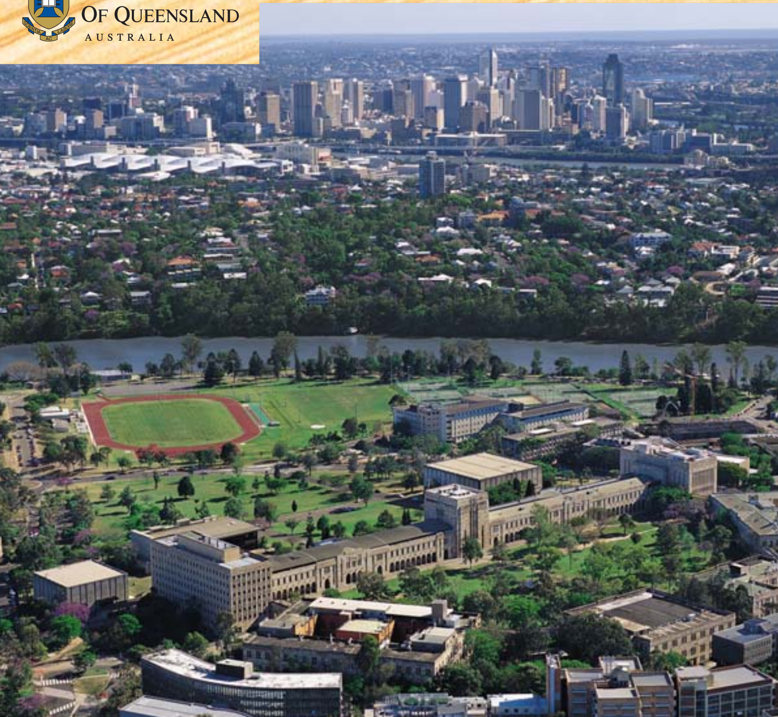
View of the Great Court, UQ St Lucia, looking towards Brisbane city