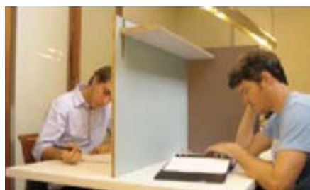
Figure 4: Study Desks.