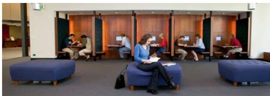
Figure 2: Ipswich Library Study Booths, UQ.

What became apparent was the need not only for redesigned learning space, but also for space which could be repurposed during the course of the academic cycle. At the start of the academic year, students sought group space, coupled with a need for library staff support for orientation activities. As the semester unfolded, staff support was less in demand, with even greater emphasis