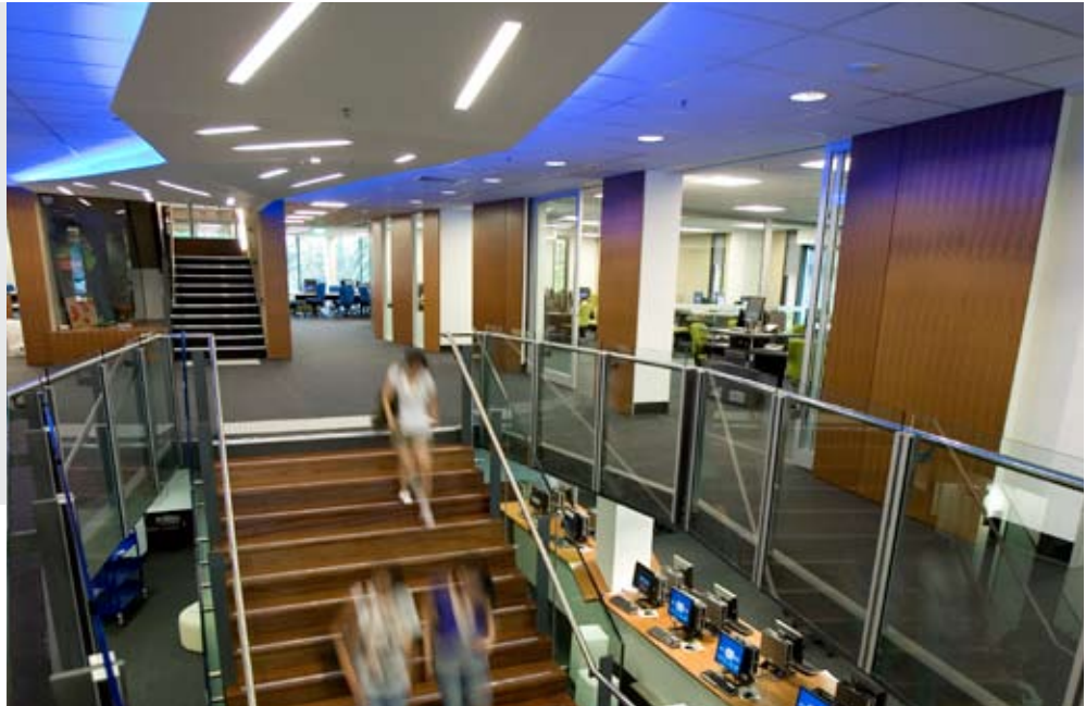
Figure 3: The new Biological Sciences Library, UQ.

Whilst there are many great libraries in modest institutions, no great university is without an outstanding library. That status remains of tremendous importance, and few researchers would dispute the need for extensive collections of scholarly information and the support of experienced librarians in their scholarly endeavours, although with a strong preference for that support to be delivered in the school or laboratory rather than in the library. However, the notion of library as place in that dynamic has shifted. Academics report fewer visits to the library than was the case only a few years ago, and many predict a continued decline in years to come (RIN 2007). The importance of the library's print collections is also diminishing, with desktop delivery of electronic information seen as a fundamental requirement (British Academy 2005). Many report a reluctance to visit the library to copy a journal article held on