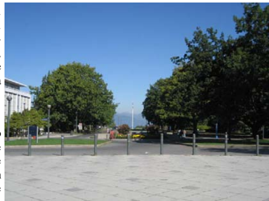
University of British Columbia Vancouver Campus (Main Mall)

I was initially somewhat shocked with how open Canadian's are to unfamiliar people. I don't know if Australia went too hard on the 'stranger danger' part of our education but here Canadians you have never met will talk to you like you've know them for ages. They even hold the door open for you and wait for you if you're not quite there yet.