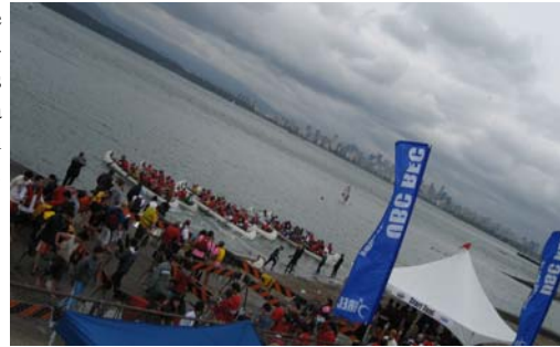
UBC Rec Day of the Longboat (Jericho Beach)

(Duch Girl and Duchesnews Foreign Correspondent)