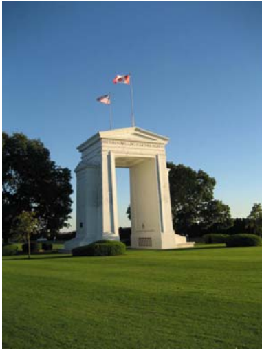
Peace Arch at the US/Canada border