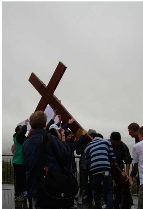
The World Youth Day Cross atop Mt Cooth-tha. Several Duchesne residents braved the elements on the dawn pilgrimage up the mountain along with Archbishop Bathersby and a host of other people from around the Archdiocese of Brisbane. World Youth Day will be held in Sydney on the 20th of July, 2008.

This newsletter is also available electronically at: www.uq.edu.au/duchesne