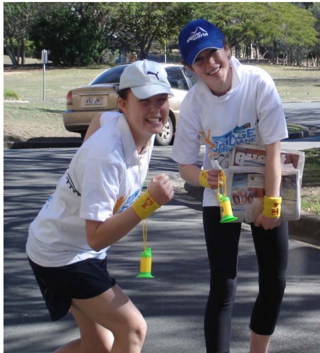
"Motor" and "Catch me if you can!" relive the glory and magic of the 10th Annual Bridge to Brisbane Fun Run.

Life Saving Queensland in view of 2007 being The Year of the Lifesaver. Over the past 10 years the event has raised over $1.93 million for charity. This year the milestone will be smashed with over $2 million raised since the event started in 1997.