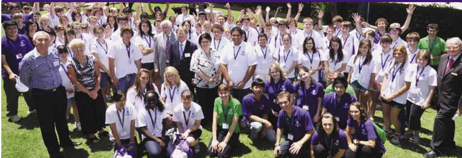
Inaugural Young Achievers Program residential camp, St Lucia campus, February 2010