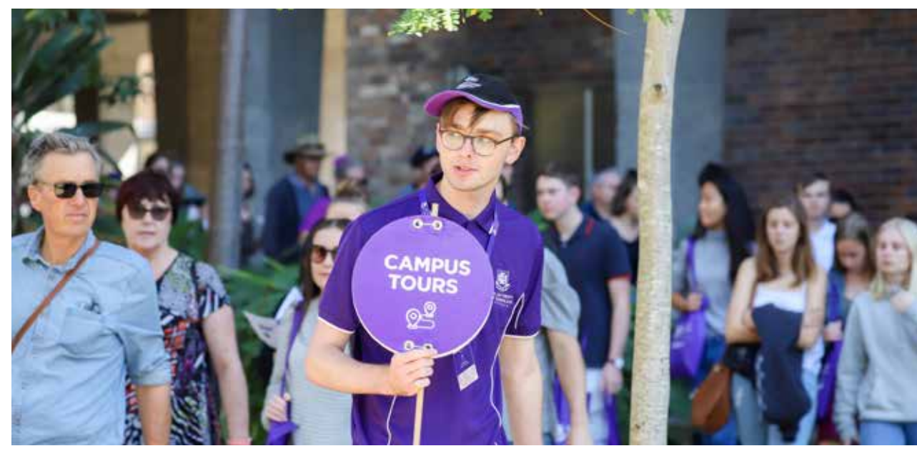
More than 25,000 people attended UQ Open Days to explore different facets of university, from programs and career options to student life, including taking part in student ambassador-led campus tours.