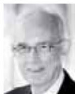
The Honourable Sir Llewellyn Edwards, AC

The Vice-Chancellor is our Chief Executive Officer. He is supported by a seven-member Executive as detailed on these pages.