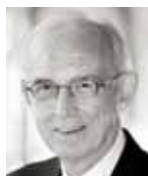
The Honourable Sir Llewellyn Edwards, AC

MB BS Qld. , Hon LLD Qld. , Hon DUniv QUT , FRACMA, FAIM