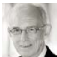
The Honourable Sir Llewellyn Edwards, AC

The Chancellor and Deputy Chancellor lead our 35-member University Senate and are elected from its ranks. The Vice-Chancellor is our Chief Executive Officer. He is supported by a six-member Executive as detailed on these pages.