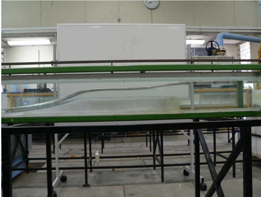
Photograph of a broad-crested weir - Flow from right to left